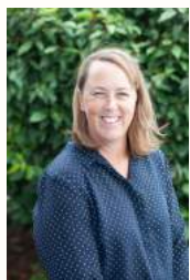
HB7 and HB8